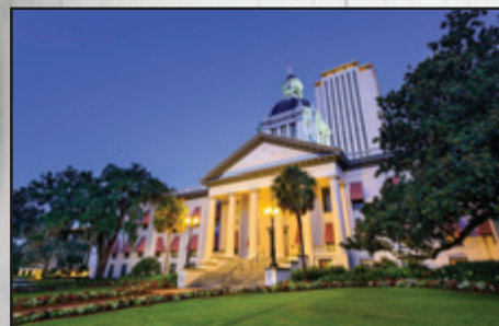
The old and new Capitol buildings in Tallahassee.

INSIDE: Our state lawmakers wrapped up the session. See how it affects you. A9 ▶