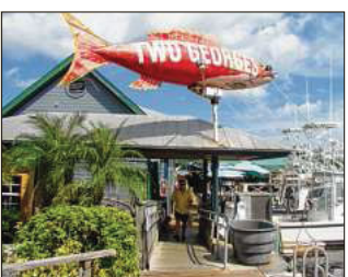
IN FOCUS: BOYNTON BEACH THURSDAY