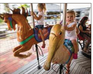
PALM BEACH GARDENS FRIDAY