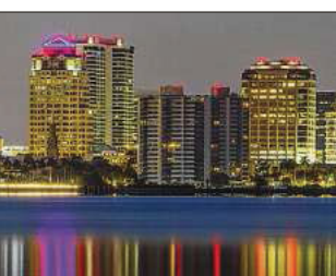
WEST PALM BEACH SATURDAY