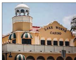
LAKE WORTH MONDAY