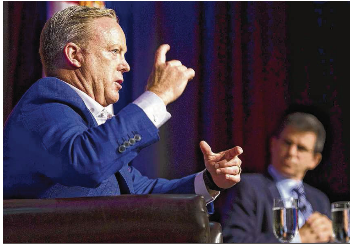
Sean Spicer, former White House press secretary, told the Forum Club of the Palm Beaches he wishes he had another shot at discussing the crowd size at Trump's inauguration.